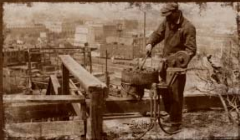
Building the steel stairway up the bluff in St. Paul.

The Engineer collection offers superior craftsmanship with the Red Wing standard of durability and comfort stitched into every boot. Using Red Wing Shoe Company leathers with a rough scratched in feel, these boots are built for hard work in tough demanding conditions just like when America ran on the rails.