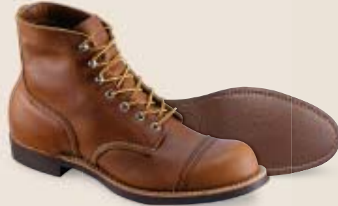
NEW Style No. 8112 6" IRON RANGER

LEATHER Amber Harness SOLE Nitrile Cork CONSTRUCTION Goodyear Welt LAST No. 8 PRODUCT CARE Leather Cleaner, Boot Oil USA MEN'S SIZES D 7-12, 13, EE 7-12