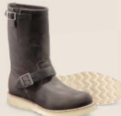
Style No. 2975 11" ENGINEER

LEATHER Black Lumberjack SOLE Traction Tred CONSTRUCTION Goodyear Welt LAST No. 522 PRODUCT CARE Leather Cleaner, Boot Oil USA MEN'S SIZES D 4-12, 13 (for women's sizes, see conversion chart)