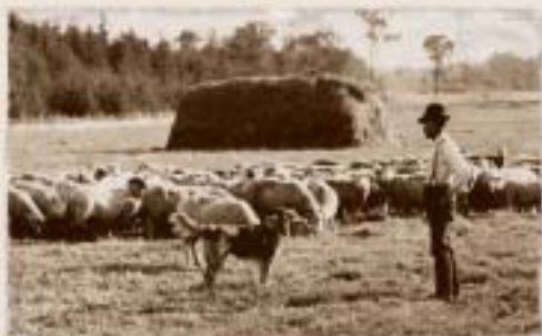
Farmer with his flock of sheep