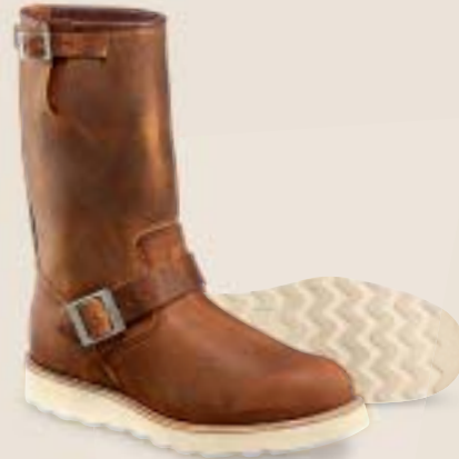
Style No. 2971 11" ENGINEER

LEATHER Briar Oil Slick SOLE Traction Tred CONSTRUCTION Goodyear Welt LAST No. 522 PRODUCT CARE Leather Cleaner, Boot Oil USA MEN'S SIZES D 4-12, 13 (for women's sizes, see conversion chart)