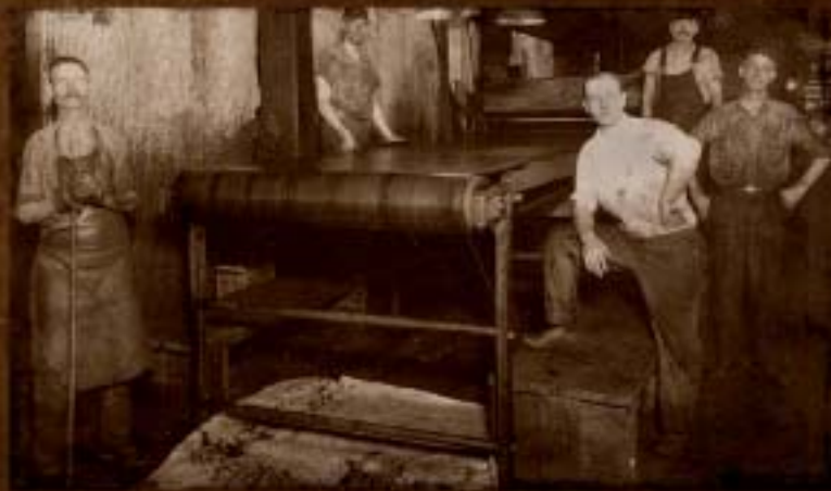
S.B. Foot Tanning Co., Finishing Department

Located in Red Wing, Minnesota the S.B. Foot Tanning Co. has been crafting a raw, natural material into a perfect piece of finished leather since 1872. Over the years the tannery has built a reputation for tanning the highest quality and the most durable leathers. As every hide is unique, it takes a watchful eye and a sensitive feel for the leather, skills that only come from years of experience. Red Wing Shoe Company has been using S.B. Foot leather since our inception in 1905. It is a partnership which has endured, just like our world famous work boots.