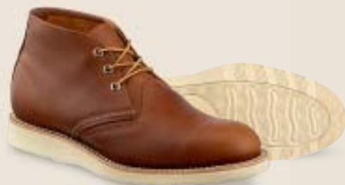
Style No. 3140 CHUKKA

LEATHER Oro-iginal SOLE Euro-Traction Tred CONSTRUCTION Goodyear Welt LAST No. 210 PRODUCT CARE Leather Protector, Boot Oil USA MEN'S SIZES D 7-12, 13, 14