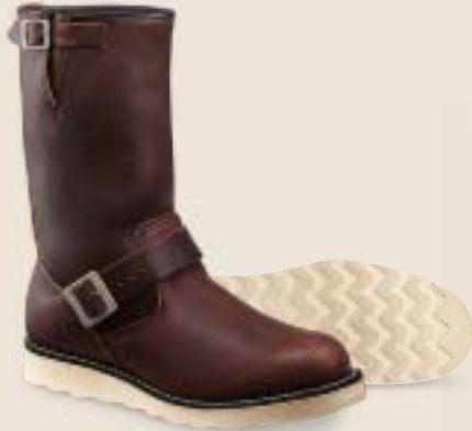
Style No. 2970 11" ENGINEER

LEATHER Briar Oil Slick SOLE Traction Tred CONSTRUCTION Goodyear Welt LAST No. 522 PRODUCT CARE Leather Cleaner, Boot Oil USA MEN'S SIZES D 4-12, 13 (for women's sizes, see conversion chart)