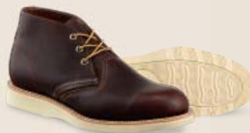
Style No. 3141 CHUKKA

LEATHER Oro-iginal SOLE Euro-Traction Tred CONSTRUCTION Goodyear Welt LAST No. 210 PRODUCT CARE Leather Protector, Boot Oil USA MEN'S SIZES D 7-12, 13, 14