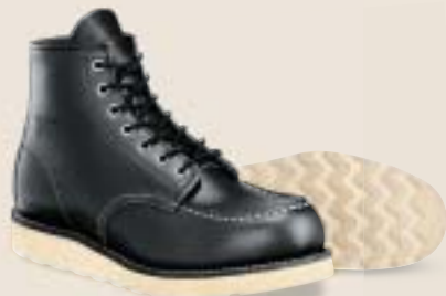
Style No. 8130 6" CLASSIC MOC

Copper Rough & Tough Traction Tred Goodyear Welt 45 Leather Cleaner, Mink Oil D 7-12,13