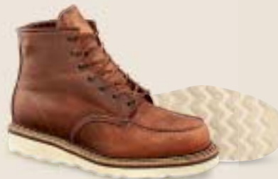
Style No. 1907 6" CLASSIC MOC

Our Classic Work boots were made to withstand the rigors of hard work and the brutality of harsh weather. These boots earned their reputation on the farms and cities of America's heartland. Today, these American classics feature the highest quality materials, craftsmanship and signature Red Wing leathers.