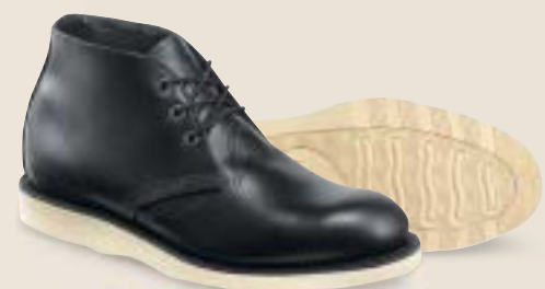
Style No. 51058 CHUKKA

LEATHER Sand Mohave SOLE Euro-Traction Tred CONSTRUCTION Goodyear Welt LAST No. 210 PRODUCT CARE Nubuck/Suede Cleaner Kit USA MEN'S SIZES D 7-12, 13, 14