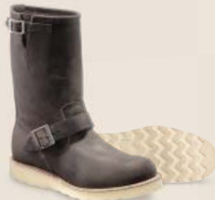
Style No. 2975

Black Lumberjack Traction Tred Goodyear Welt 522 Leather Cleaner, Boot Oil D 4-12, 13