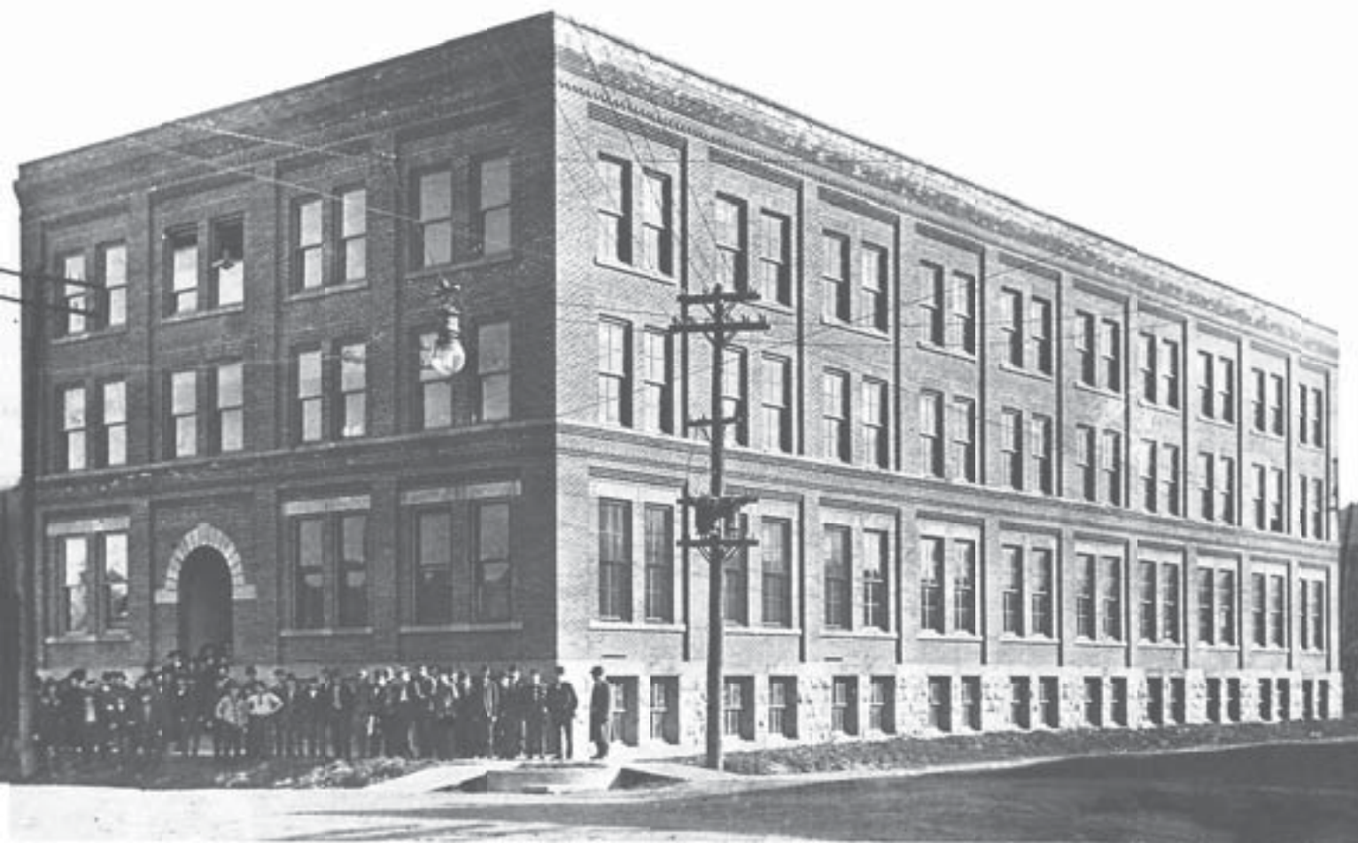
1909 PLANT 1 - RED WING, MN