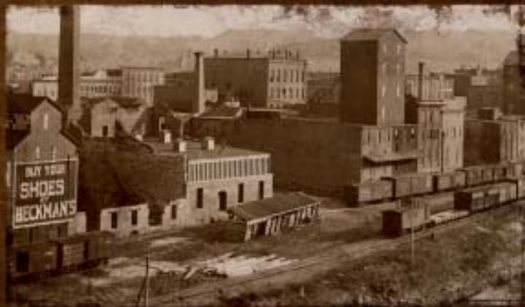
A general view of Red Wing