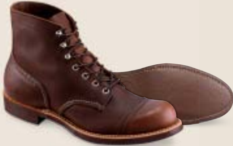
Style No. 8111 6" IRON RANGER

LEATHER Amber Harness SOLE Nitrile Cork CONSTRUCTION Goodyear Welt LAST No. 8 PRODUCT CARE Leather Cleaner, Boot Oil USA MEN'S SIZES D 7-12, 13, EE 7-12