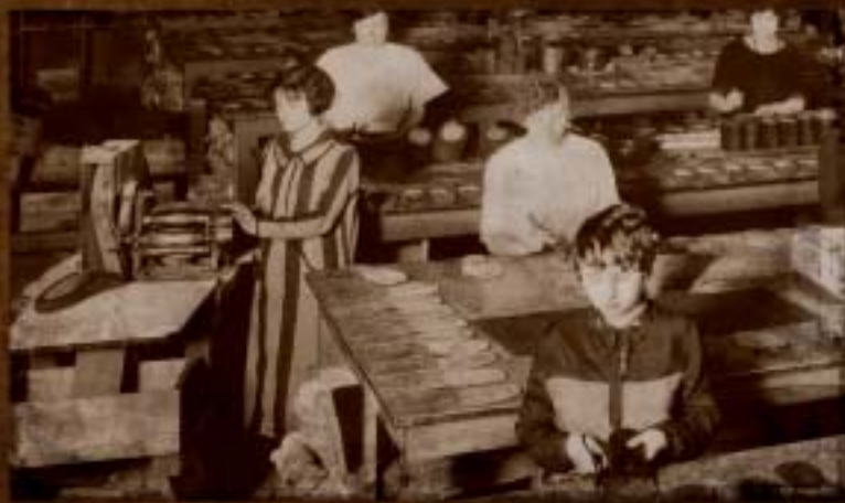
Sole & Heel Packing Room

Since 1905 women have been a part of the Red Wing Shoe Company, working in our Main Street factory making our boots with their skilled hands. Today women are still making our boots the same way as the women who came before them, using hand-crafted leather and stitching the pieces to sturdy durable soles. Someone's great, great grandmother would be very proud.