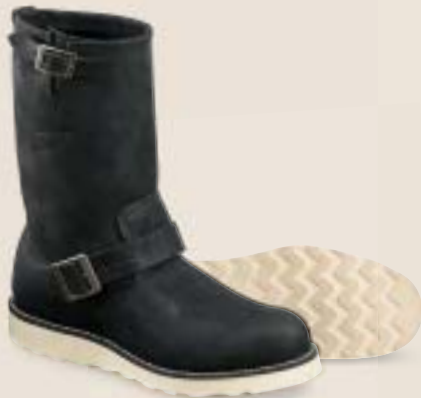
Style No. 2974