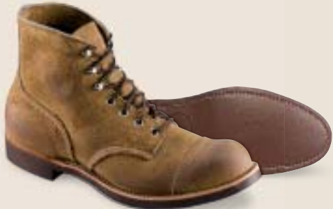
Style No. 8113 6" IRON RANGER

LEATHER Oro-iginal SOLE Nitrile Cork CONSTRUCTION Goodyear Welt LAST No. 8 PRODUCT CARE Leather Cleaner, Boot Oil USA MEN'S SIZES D 7-12, 13