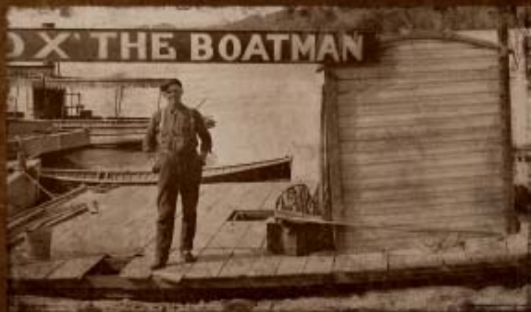
Boatman Image - Levee Park, Red Wing

The quality built into the Wabasha Collection is evident the moment you touch the shoes. Handsewn by skilled shoemakers, every pair is comfortable by design, featuring durable, rugged soles and thick leathers that soften and improve with age. Every component and every stitch reflect the quality generations of customers have come to expect from the Red Wing Shoe Company.