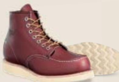
NEW Style No. 8131 6" CLASSIC MOC

Black Chrome Traction Tred Goodyear Welt 23 Leather Cleaner, Black Leather Conditioner D 7-12,13