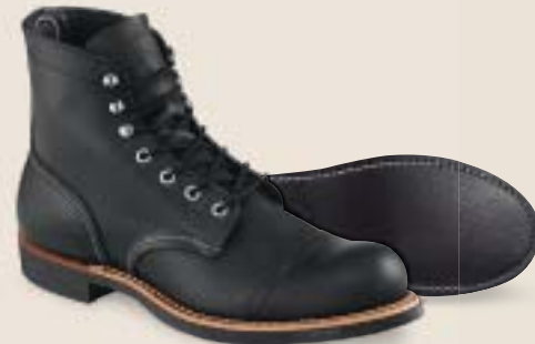
NEW Style No. 8114 6" IRON RANGER

LEATHER Hawthorne Muleskinner SOLE Nitrile Cork CONSTRUCTION Goodyear Welt LAST No. 8 PRODUCT CARE Nubuck/Suede Cleaner Kit, Mink Oil USA MEN'S SIZES D 7-12, 13, EE 7-12