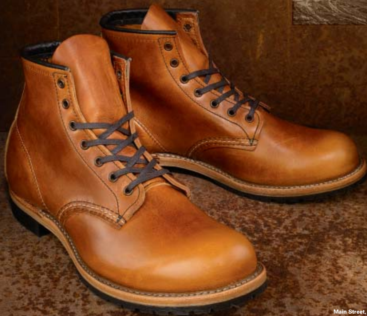
Photo Credits: Main Street, Red Wing, MN. (detail from larger image)