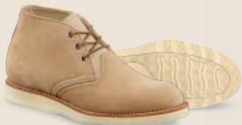
NEW Style No. 3143 CHUKKA

LEATHER Briar Oil Slick SOLE Euro-Traction Tred CONSTRUCTION Goodyear Welt LAST No. 210 PRODUCT CARE Leather Cleaner, Boot Oil USA MEN'S SIZES D 7-12, 13, 14