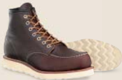
Style No. 8138 6" CLASSIC MOC

Oro Russet Portage Traction Tred Goodyear Welt 23 Leather Cleaner, Leather Conditioner D 7-12,13