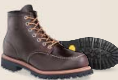
NEW Style No. 8146 6" CLASSIC MOC LUG

Briar Oil Slick Traction Tred Goodyear Welt 23 Leather Cleaner, Boot Oil D 7-12,13,EE 8-12,13