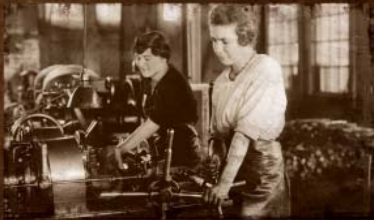
Women handling lath machines in Northern Pacific Railway's Como Shops.