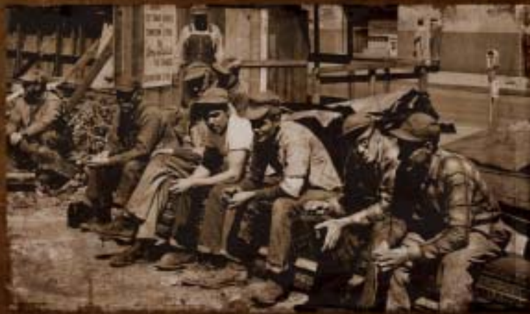
Workmen tearing down the Newton Building in St. Paul on break.

Inspired by our classic work boots, the round toe design uses one piece of leather versus two to form the work boot toe. As seams are the weakest point of a work boot, eliminating the need to stitch two pieces of leather made an already tough boot even tougher. Classic white crepe soles and Red Wing signature leathers complete the unique look.